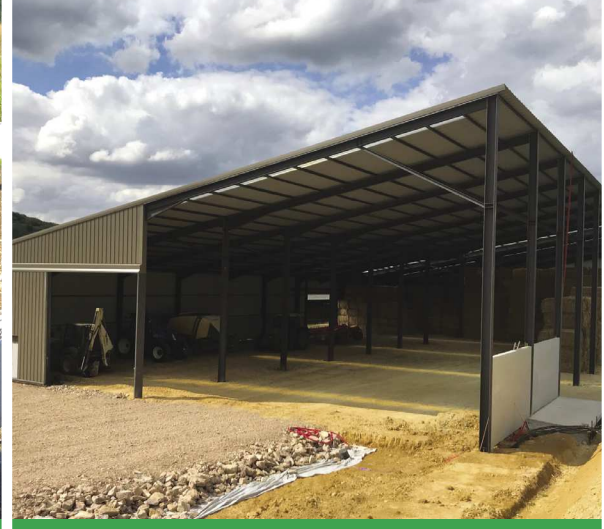
AGRICULTURAL EQUIPMENT STORAGE BUILDINGS