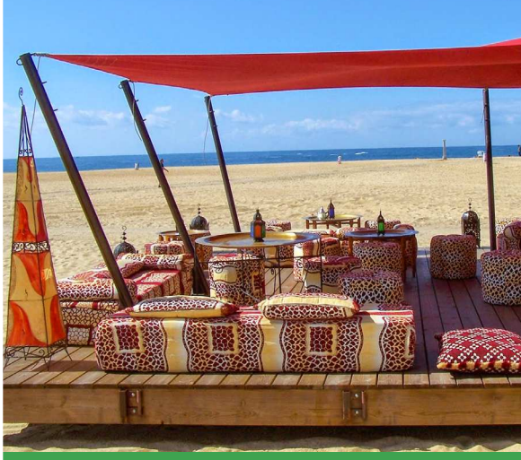
SEASONAL / TEMPORARY INSTALLATIONS