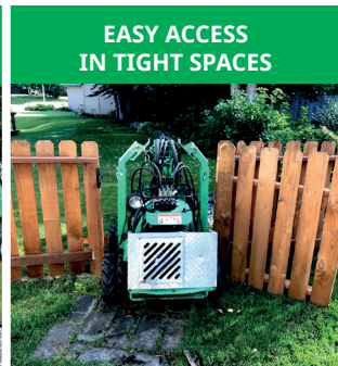
EASY ACCESS IN TIGHT SPACES