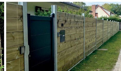
FENCES & MORE