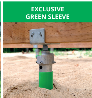
EXCLUSIVE GREEN SLEEVE