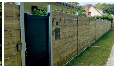
FENCES & MORE