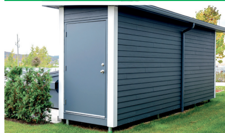
SHEDS & SHELTERS