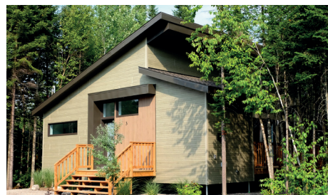
HOMES & COTTAGES