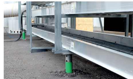
SUPPORTS FOR EQUIPMENT