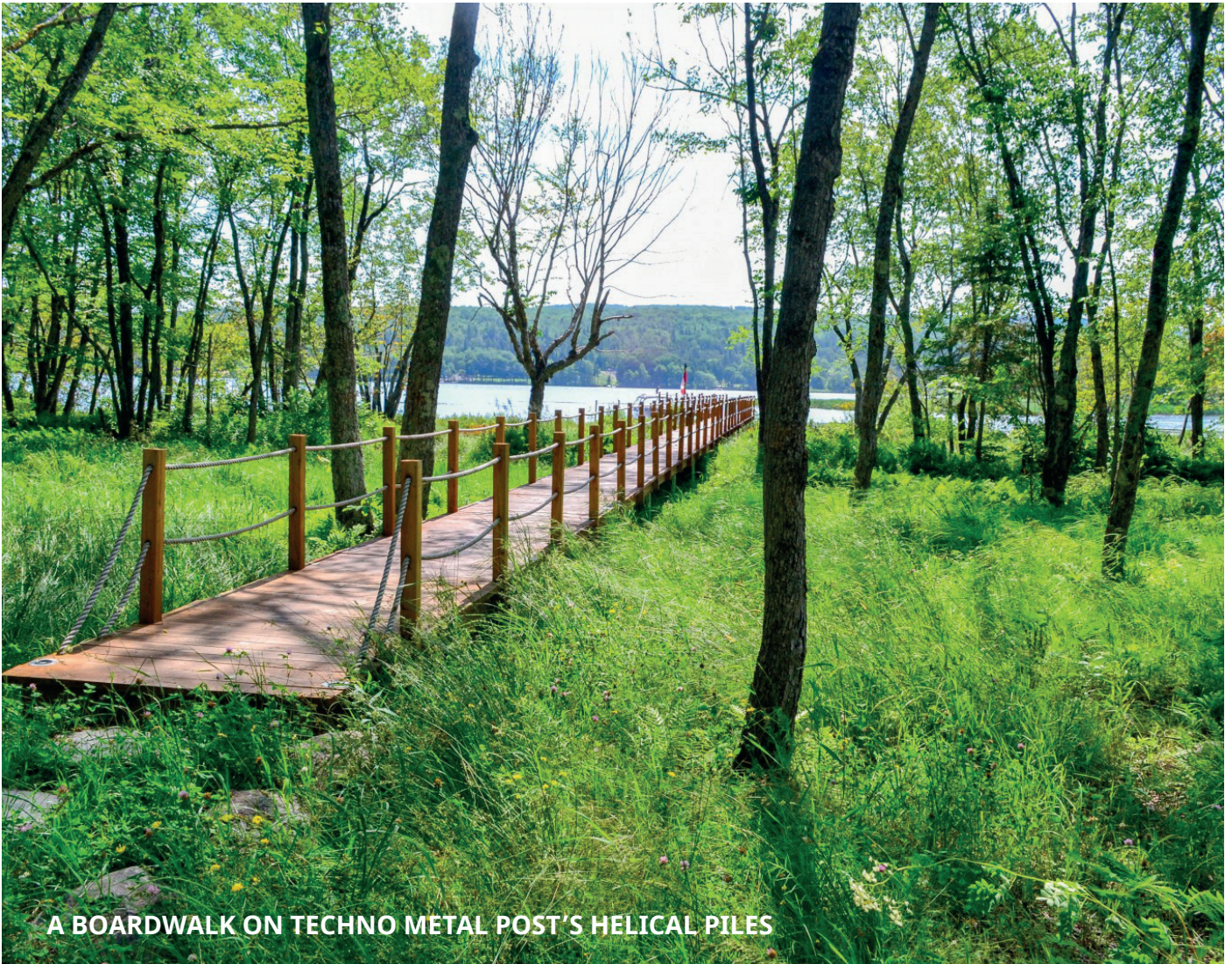
A BOARDWALK ON TECHNO METAL POST'S HELICAL PILES

COASTAL BUILDING SITES BOARDWALKS DOCKS FENCES EXTENSIONS SOLAR PANELS AGRICULTURAL SHEDS MOBILE HOMES SPORTING HALLS TEMPORARY STRUCTURES TIMBER-FRAME HOUSES SIGNS CHALETs CONSTRUCTION SITE ACCOMMODATIONS SCHOOL PARKS UNDERPINNING TRADITIONAL HOUSES CAR PORTS OVERLOOKS MODULAR BUILDINGS PERGOLAS AQUATIC SITES RAMPS DECKS STAIRS BALCONIES CABINS SWIMMING POOLS